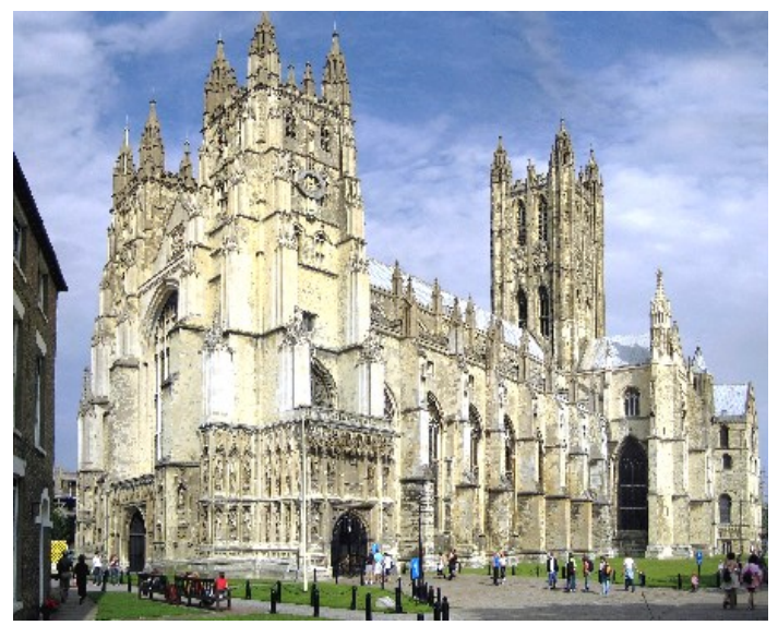
will have a walking tour of the city of Canterbury, finishing in ample time for us to attend Evensong.

Today will be devoted to a thorough exploration of Canterbury, starting with a pilgrim Eucharist in the cathedral, and a full guided tour. In the afternoon, we