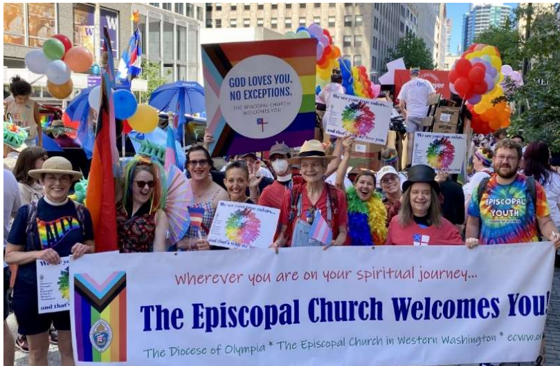
The Episcopal Church of Western Washington at Seattle Pride Parade 2022