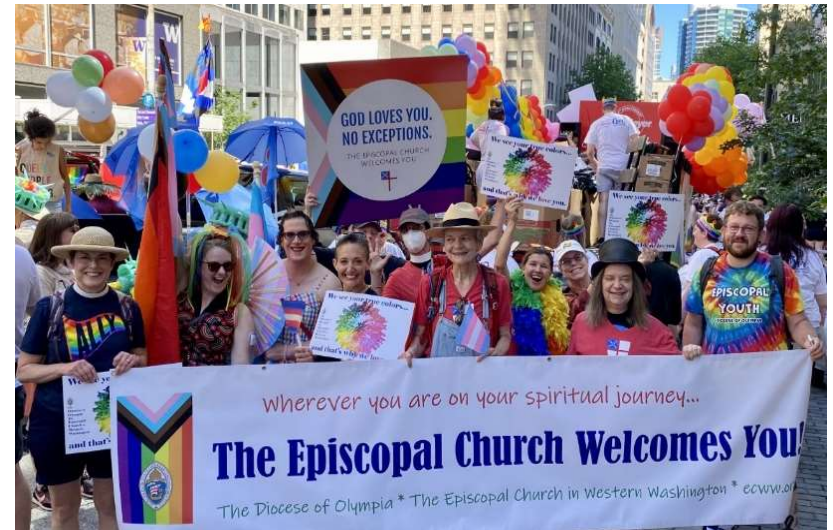
The Episcopal Church of Western Washington at Seattle Pride Parade 2022

Find a church near you: ecww.org/find-a-church